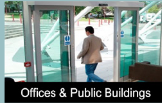
Offices & Public Buildings