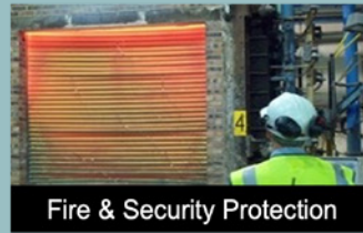
Fire & Security Protection