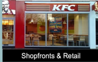
Shopfronts & Retail