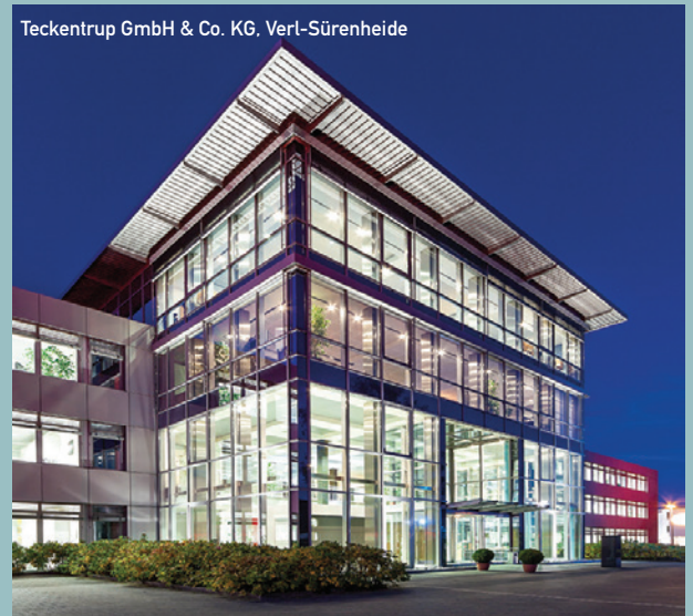
Teckentrup GmbH & Co. KG, Vert-Sürenheide